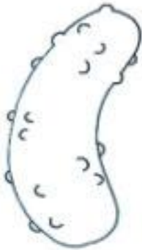
Organic Vegetable (Grown on a farm)