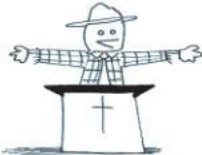
Organic Pastor (Grown on a farm)