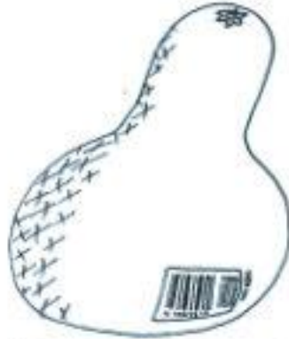
Non-Organic Vegetable (Manufactured in a lab)