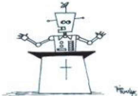
Non-Organic Pastor (Manufactured in a lab)