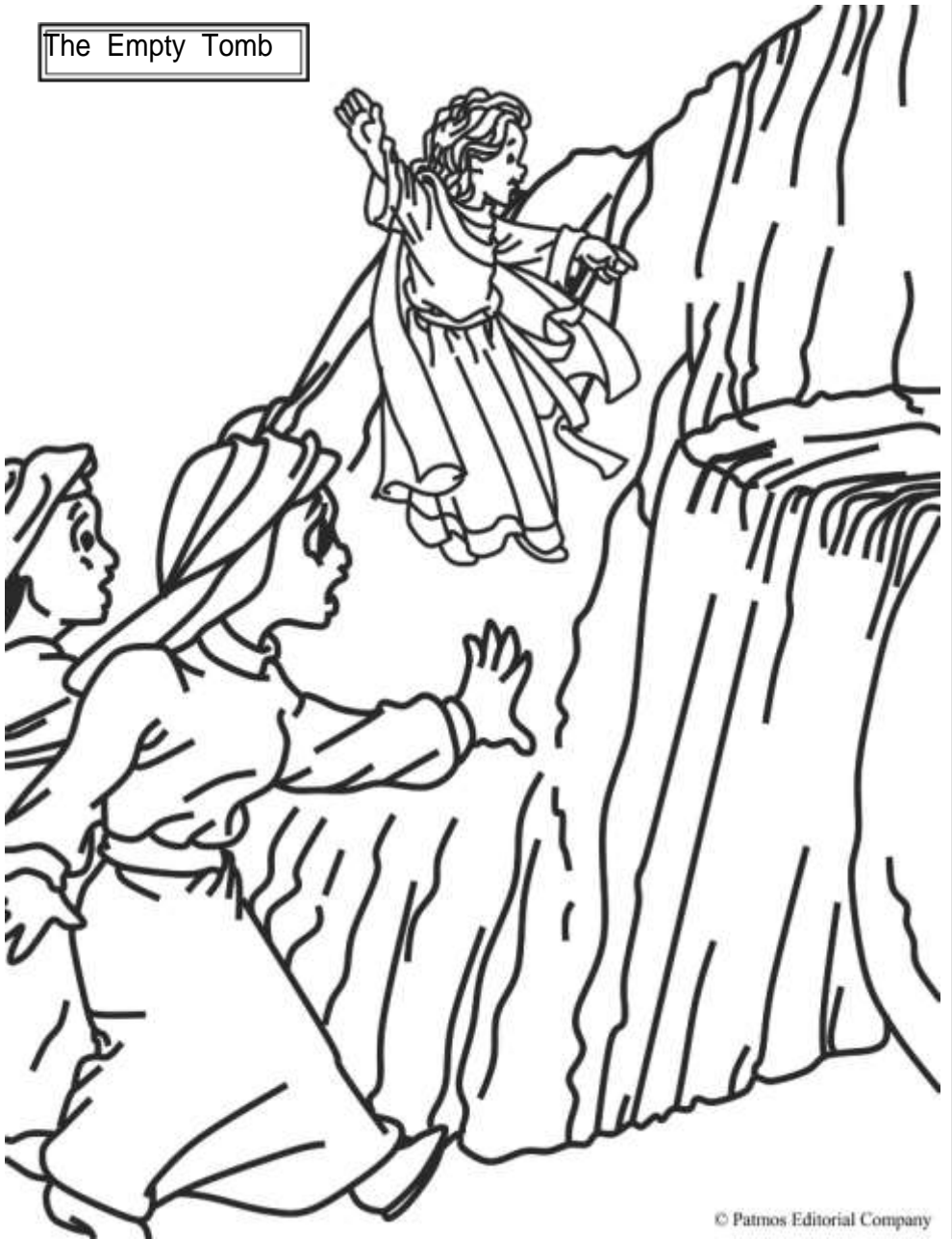
The Empty Tomb